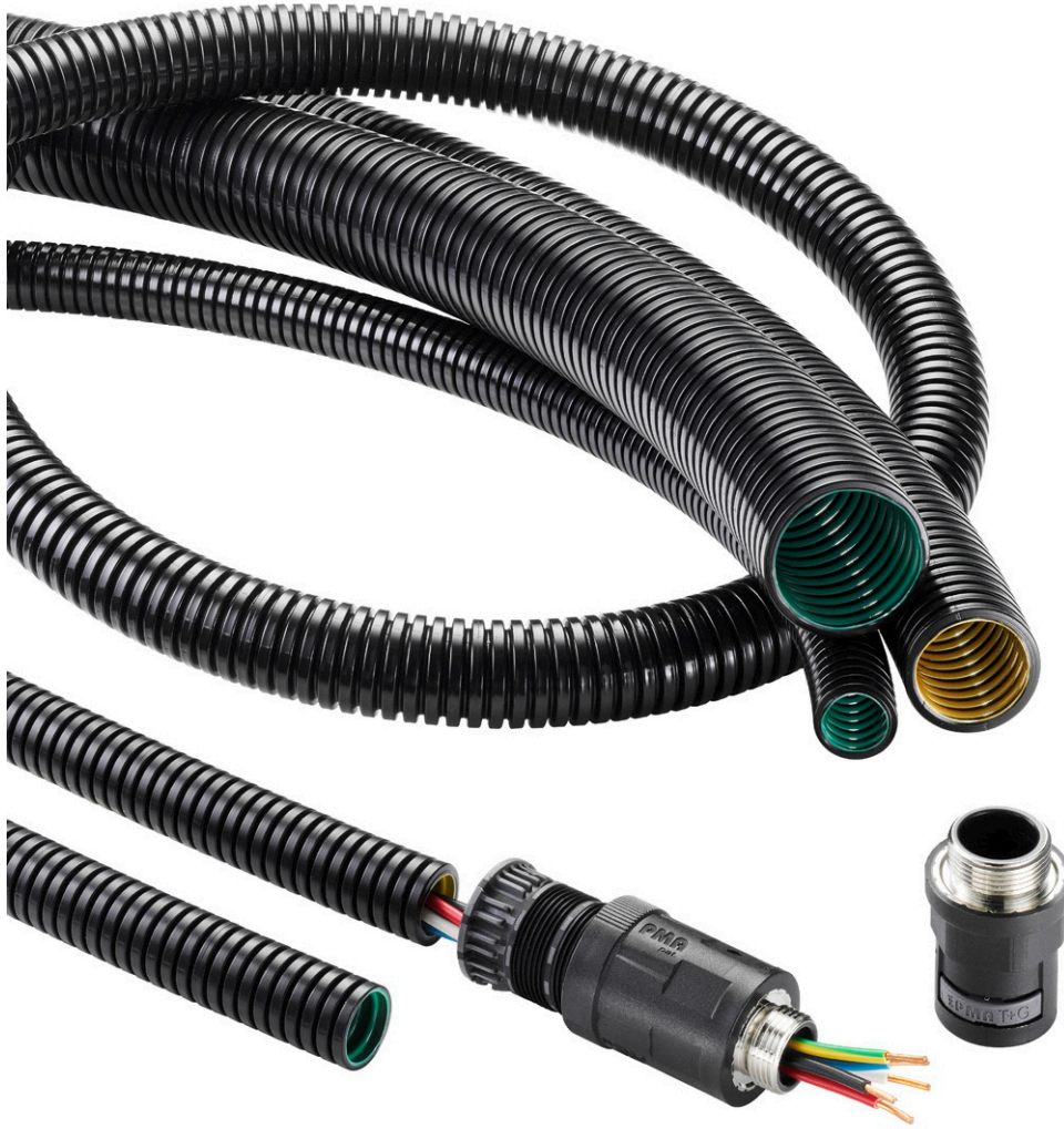
ABB and HUBER+SUHNER

— With the PMA cable protection product range, ABB offers an extensive portfolio of conduits, fittings and main accessories for a variety of markets and applications. The picture shows a PMAFIX Pro fitting with various PMA multilayer conduits.